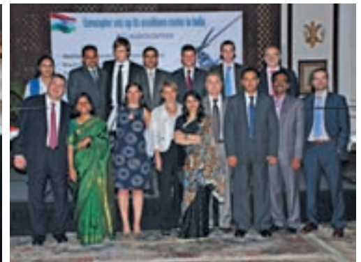
Eurocopter inaugurated its 25th subsidiary, Eurocopter India, on October 20, 2010 in New Delhi at a ceremony attended by government officials, customers and members of the press.

In order to establish a solid foothold in one of the world's most promising markets, Eurocopter inaugurated Eurocopter India, a wholly-owned subsidiary, last October. India is an emerging economic giant, but only 250 helicopters are currently operating in the country's civil market. This figure, which has already shot up due to rapid economic growth over the past few years, could triple in just five years if a coherent regulatory framework were put in place—something Indian operators have been calling for in no uncertain terms. The military market also shows enormous potential as several major calls for tenders are expected in the upcoming months ( see inset ). "In the past, Eurocopter was represented by a distributor in India," explained François Bordes, executive vice-president of International Affairs at Eurocopter. "But that setup was no longer sufficient for us to meet our growth objectives or seize the new opportunities that are sure to emerge in the Indian market. The creation of a new subsidiary, our tenth in Asia and 25th worldwide, was a logical choice—even more so because Eurocopter has always set itself apart from the compe-