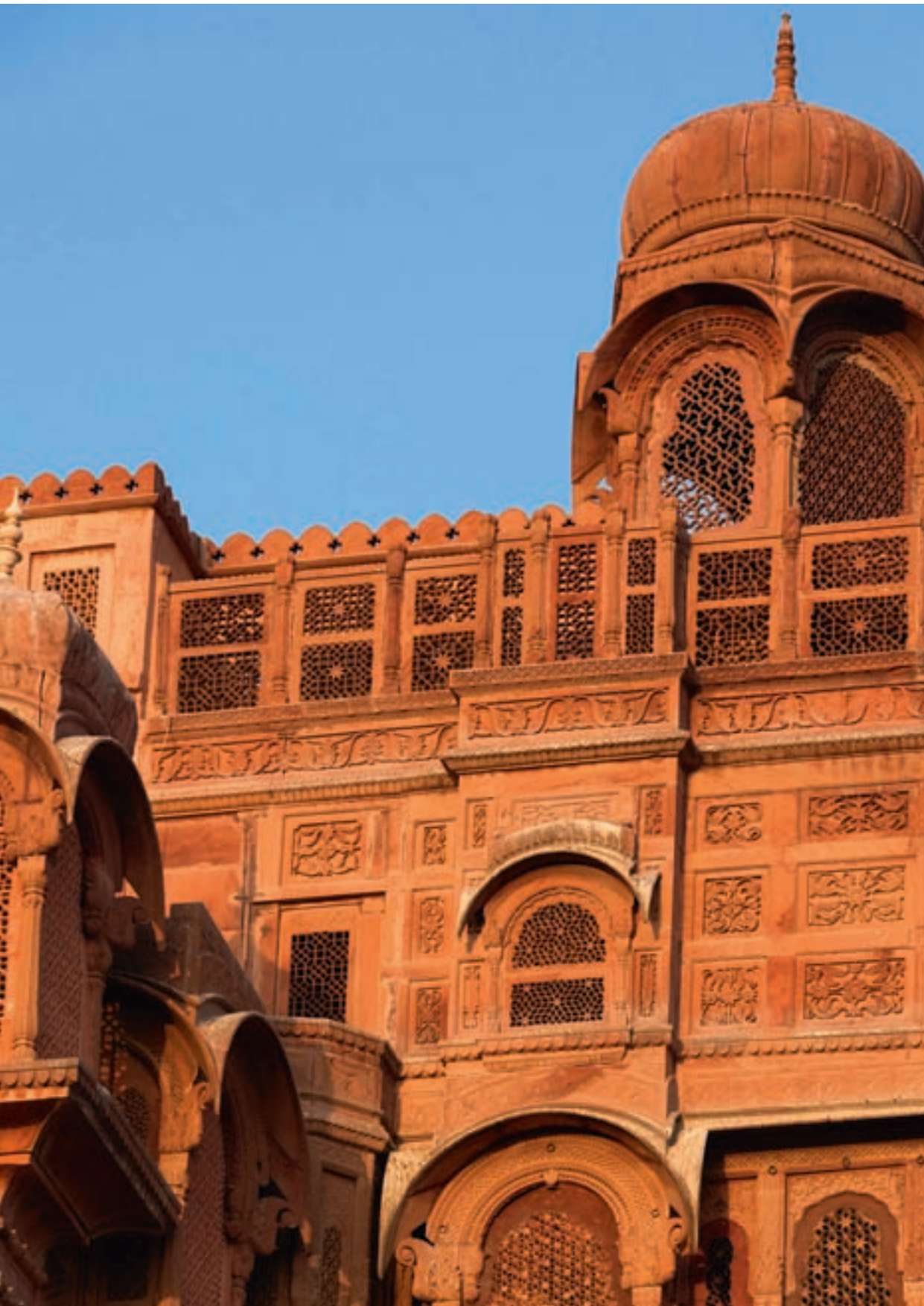
The Agra Red Fort.