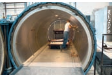
Eurocopter Canada is the only Eurocopter subsidiary that produces composite structural components for the assembly lines in Europe.