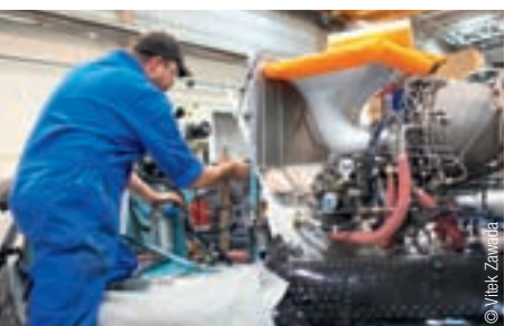
The company performs activities such as repair and conversions of aircraft.