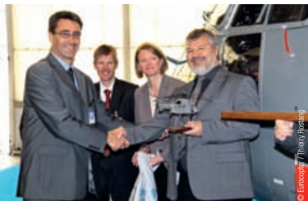
This Super Puma from the 9000 Series of helicopters complements the 2 AS350 B3 Ecureuils already operated by Eagle Helicopter AG.