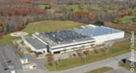
Eurocopter Canada has a 12,600 m 2 plant in Fort Erie.